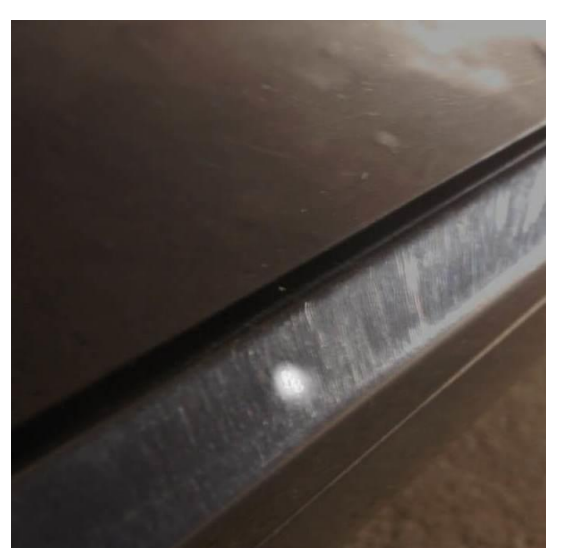
Fig 7. Dirt on the tracks

There have been also cases where our system has unfortunately created false alarms. Figure 3 shows a case of such a false alarm. The white dirt on the track in Figure 3 can be clearly noticed. This dirt caused a false alarm as this track segment is damaged; whereas this track segment is actually in order.