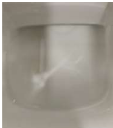
Fig. 1 Light Reflection in Toilet Bowl

The original intention of P-frame is saving space, because subsequent frames tend to be similar to their previous frames in many cases; however, for our implementation there is a different benefit for P-frames – Sometimes there is a light on the water in the toilet bowl like in Figure 1. This can be misinterpreted by the toilet facility as waste that should be flushed. So, taking the P-frame can validate that such a misinterpretation will not happen, because the light will exist in the previous frame as well; however, turning on or turning off the light in the rest room indeed sometimes caused the toilet facility to release water.