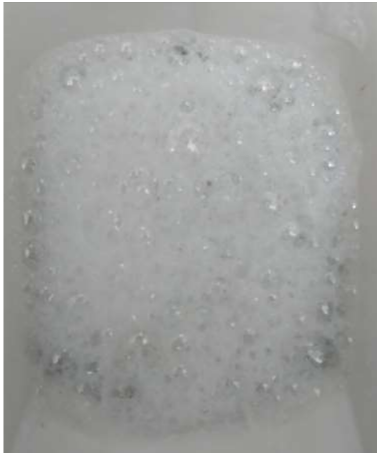
Fig. 5 Foam in a toilet bowl

There are also some detergents that make the water blue and because we take the P-frame and there might be shade differences, between the successive frames, the values of the 8X8 JPEG block will not be zero; however, since the entire 8X8 JPEG block has the same color, JPEG will be able to compress such block into a small files, so no flush will be done.