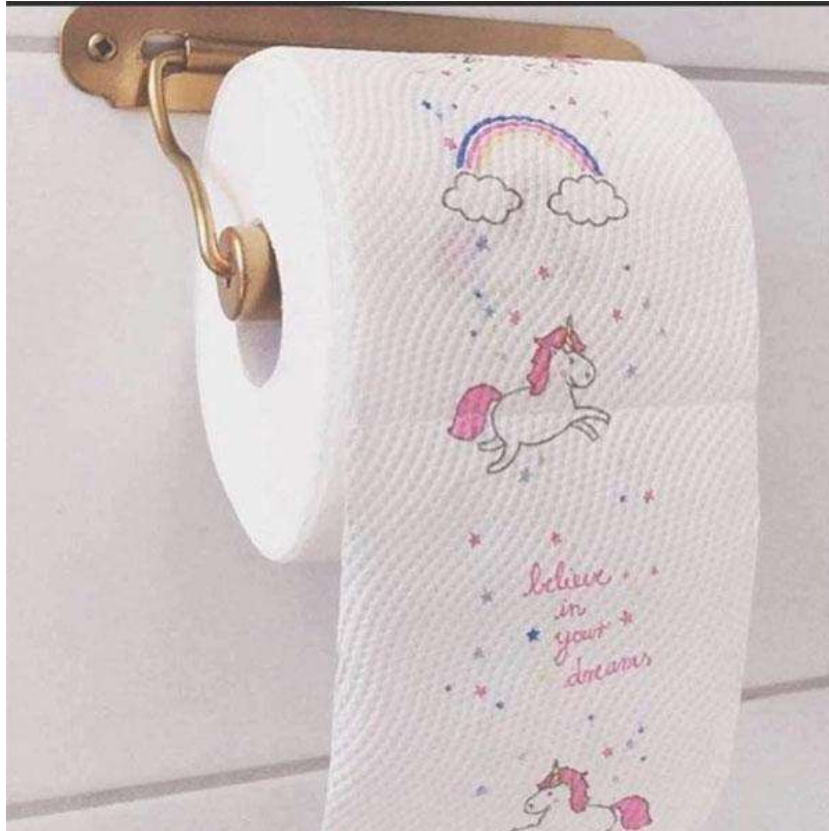
Fig. 4 Toilet paper with drawing

When the toilet bowl is full with urine, the JPEG file size will be also small, because a smooth yellow image has no difference in the colors and as was explained above, JPEG file size is determined by the differences in the original image; therefore, when there is almost no difference, the JPEG file size will be small and no water will be released to wash out the toilet bowl.