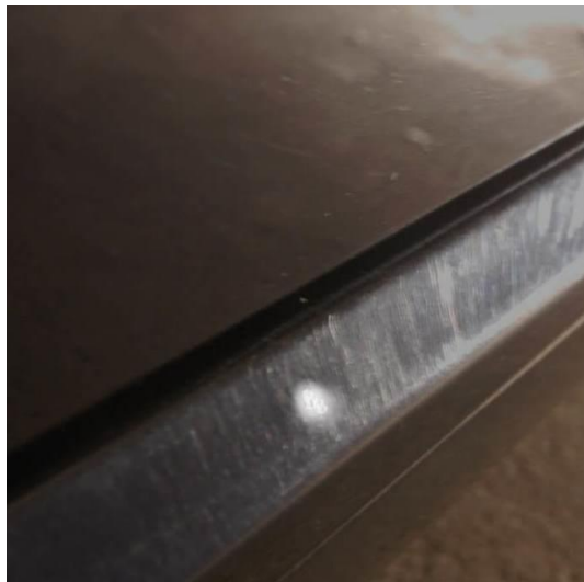
Fig 7. Dirt on the tracks

There have been also cases where our system has unfortunately created false alarms. Figure 3 shows a case of such a false alarm. The white dirt on the track in Figure 3 can be clearly noticed. This dirt caused a false alarm as this track segment is damaged; whereas this track segment is actually in order.