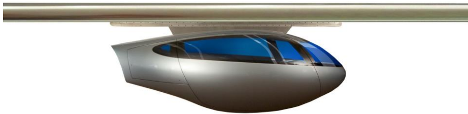
Fig. 1. SkyTran Vehicle and Track

SkyTran will make use of magnetic levitation to move compact vehicles without making contact with its tracks; nor with the ground. The compact vehicles will go along tracks installed at a height of several meters. The vehicles will make use of magnets in order to create both forward motion and avoiding contact with its tracks, so as to prevent friction. The SkyTran vehicle will have an aerodynamic shape. A model of the vehicle can be seen in Figure 1.