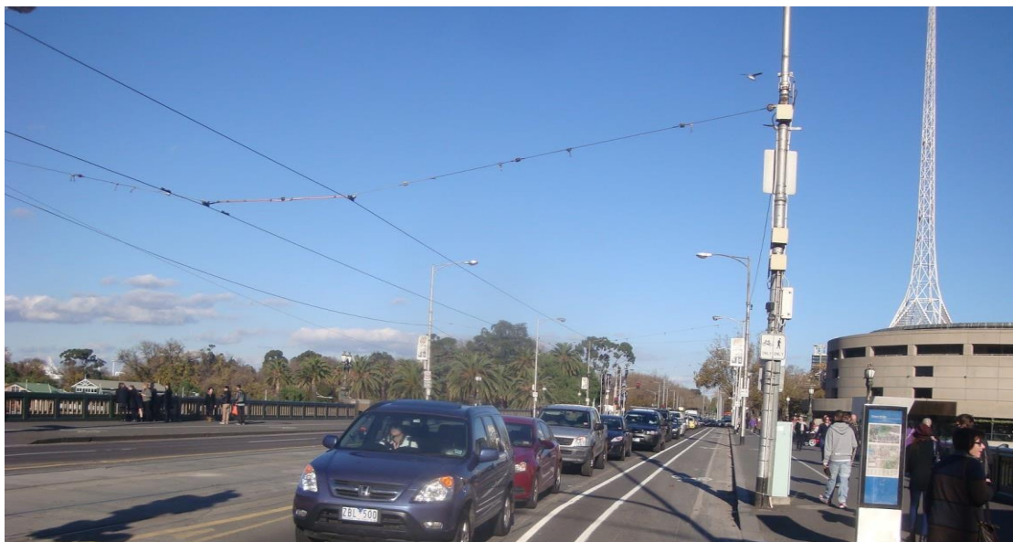
Fig 4. Road with a congested lane