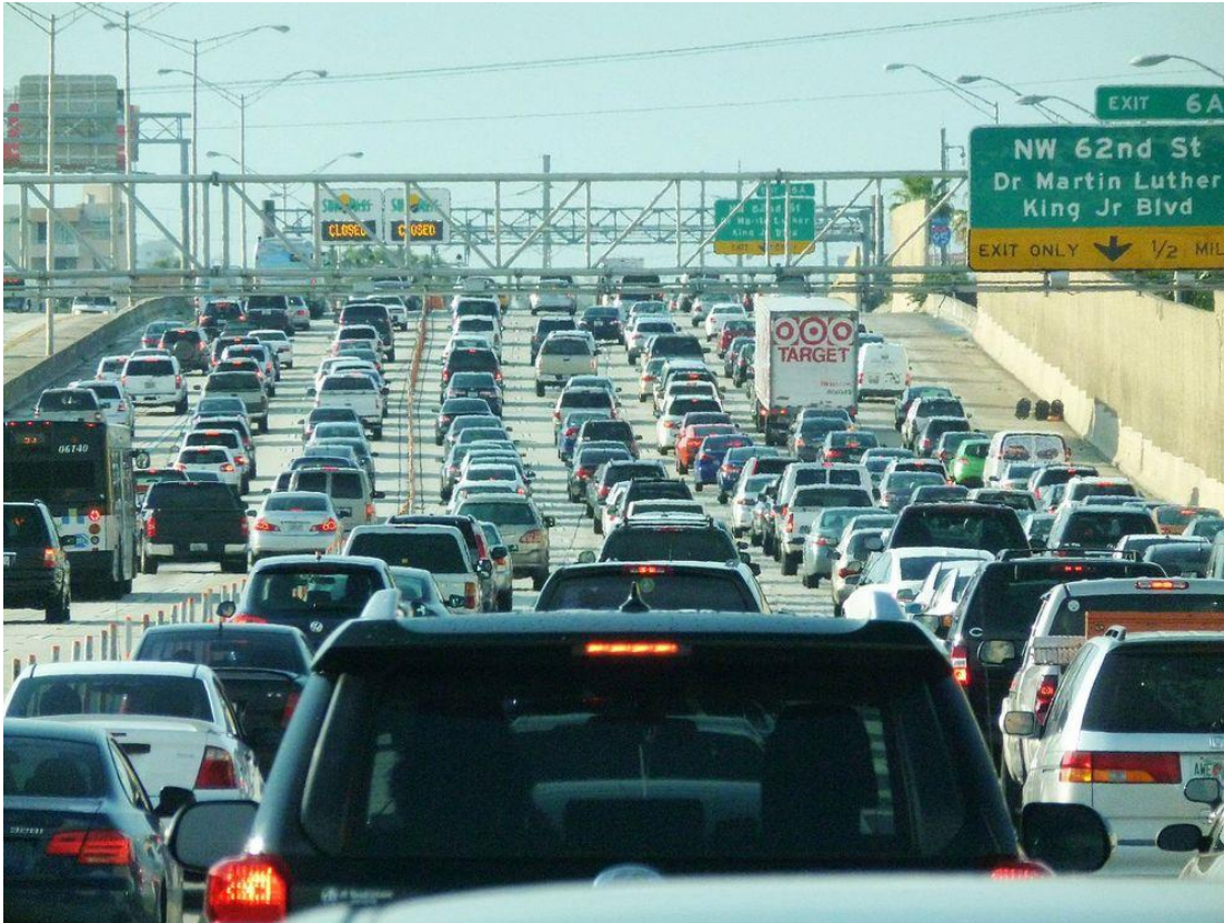
Fig. 2. Congested road

Figure 3 shows the very same road as figure 2 shows but in a different time when the traffic in the road was sparse. In such an image there are fewer changes and the image will be compressed into a smaller file.