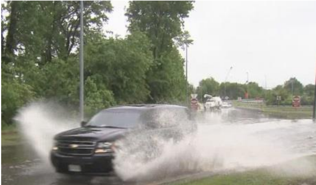
Fig 5. A flooded road with a vehicle splashes water.

Another case of a hard distinction is flooded roads where vehicles splash water on a larger size of the road which makes the system think the vehicle is larger than the dimensions of the vehicle in reality. Such a case is shown in Figure 5. Nevertheless, this misinterpretation is not harmful, because as a matter of fact splashes indeed occupy a part of the road since usually drivers prefer not to go through splashes as they are afraid not to see well through the water.