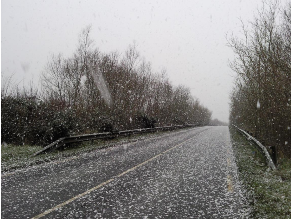
Fig 6. Road with hail